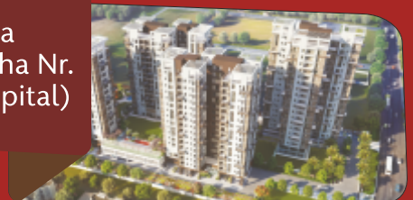
Utopia (Madurdaha Nr. Ruby Hospital)