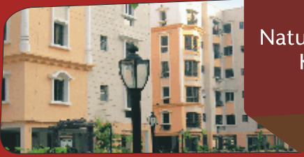
Natural Heights Kolkata