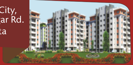
Natural City, Shyamnagar Rd. Kolkata