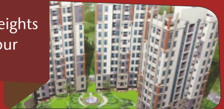
Natural Heights Durgapur