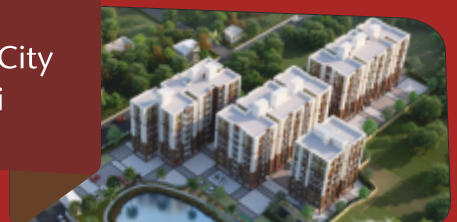
Natural City Birati