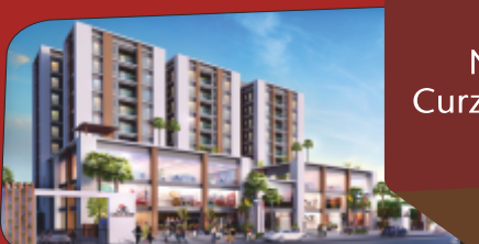
Natural Curzon Square