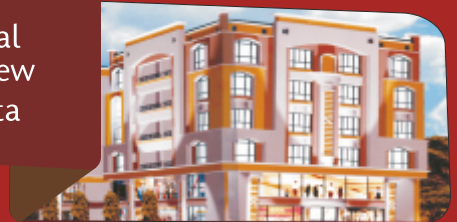
Natural Park View Kolkata