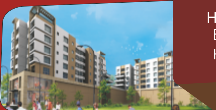
Haldiram Enclave Kolkata