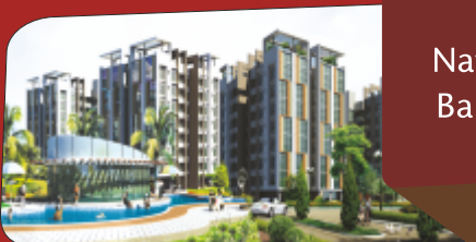
Natural City Bardhaman