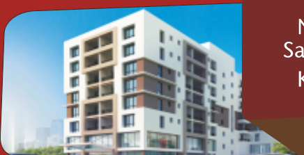
Natural Sarpapriya Kolkata