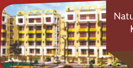
Natural Greens Kolkata