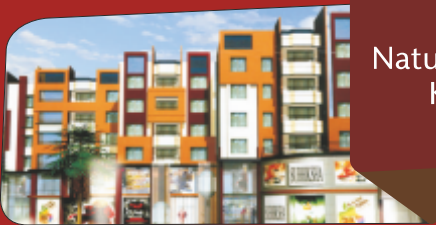
Natural Enclave Kolkata