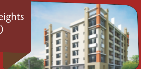
Natural Heights (Ph-II)